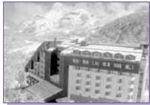
Gran Hotel, Termas de Chillan