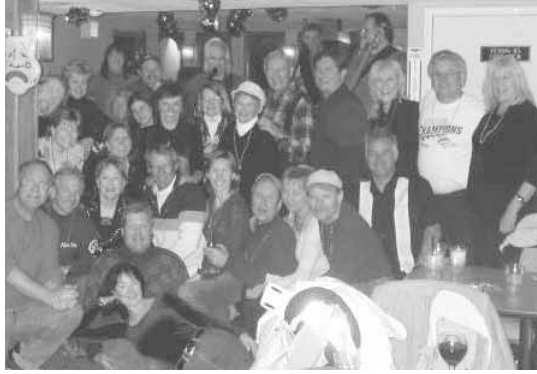
Onboard the Tahoe Queen, cast members from dancing with the stars . . .

It was three days of great skiing and fun exploring Northern Nevada's famed High Sierras @ Lake Tahoe!